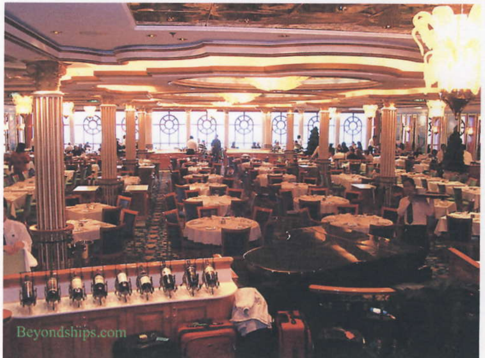
The Venetian is one of the main dining rooms on NORWEGIAN DAWN.

doing something good. I always tell the guests, write a letter and for the crew it will be a big, big plus to know that you enjoyed your cruise and they made a difference. [Some will see the letter and say to themselves]: 'Why did he get his name mentioned, why did he get something I did not?' They will then try because there is a competition amongst all of them. And we have also the system where we recognize on stage with the captain on a monthly basis 'Dress to Impress' [the crew member who] is always well groomed and tries to look nice. We have a lot of awards."