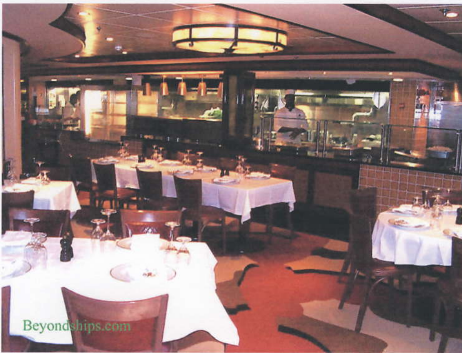
Above: Cagney's, the 1930s era steakhouse on NORWEGIAN DAWN Below: Tequilla, the Mexican-style specialty restaurant.