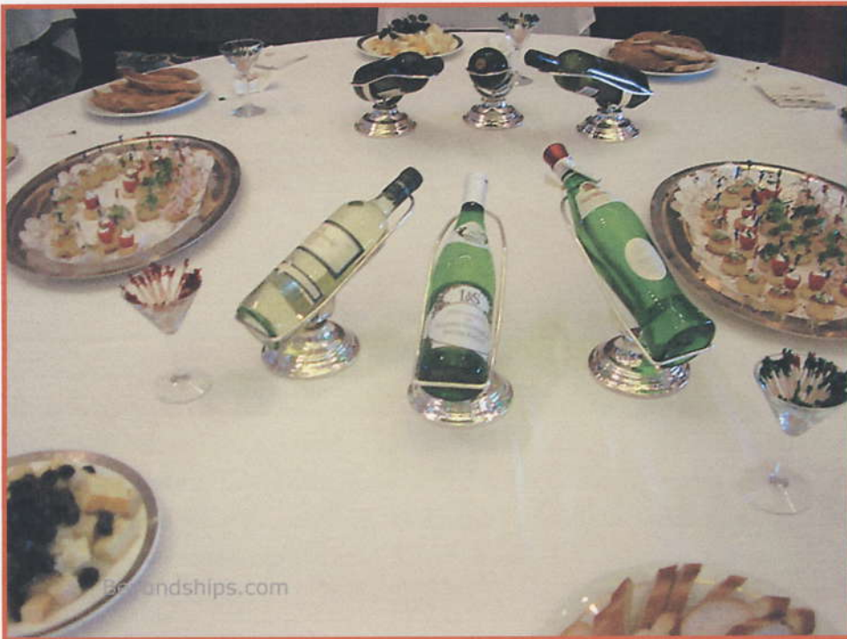
Above: A wine tasting for repeat passengers. Below: The Golden Lion Pub.